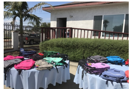
2017 Supplies donation